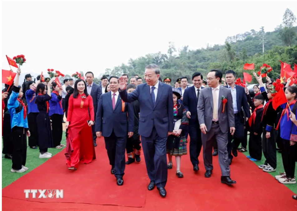
Party General Secretary Tô Lâm and Prime Minister Phạm Minh Chính attend the groundbreaking ceremony in Lạng Sơn Province on Thursday morning for 121 multi-level boarding primary and lower-secondary schools in border communes nationwide.

The move follows a conclusion of the Politburo of the Communist Party of Việt Nam to establish multi-level boarding schools in border communes and is intended to expand educational access, narrow regional disparities, and bolster national defence and security.