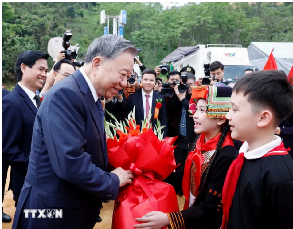
Ethnic children in Lạng Sơn Province present flowers to Party General Secretary Tô Lâm.

Simultaneous ground-breakings were held for multi-level boarding schools in border communes, a move aimed at ensuring equitable access to education for border-area students, narrowing regional disparities and strengthening national defence and security.