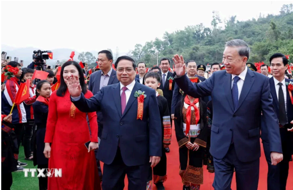
Party General Secretary Tô Lâm and Prime Minister Phạm Minh Chính greet local residents during the groundbreaking ceremony in Lạng Sơn Province on Thursday morning.

The education ministry and Ministry of Finance are reviewing proposals for funding allocation, with a target to complete the projects by August 30, 2027, in time for the 2027-28 school year.