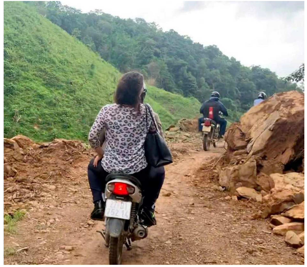
Ms. Isabelle Müller went directly to the project site in Lao Cai to inspect.

Look at me, you can see that it is possible, to develop your own abilities. I think so! Because that is a law of life. A rule may be great at a certain point in time, but times move and evolve, which means you need to adjust the rules to suit the times.