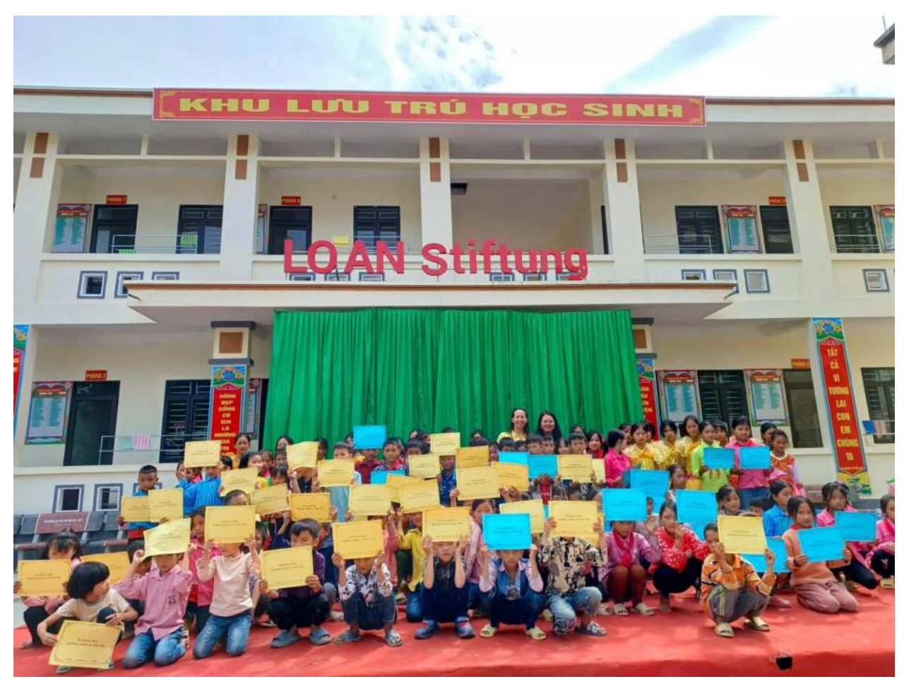
A student accommodation area in Lao Cai province sponsored by Loan Fund.