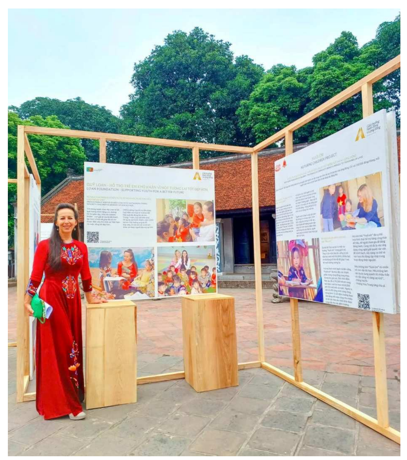
Exhibition of images of Loan Fund supporting disadvantaged children for a better future.

With this development, I am sure that Vietnam will be in a different position in the future, because Vietnamese people, like my mother, are very hard-working and dedicated, especially in developing education. I have seen these advances in young families, parents of my generation have understood that the key to a better future is education. Therefore, many families have tried to save money to invest in their children's education.