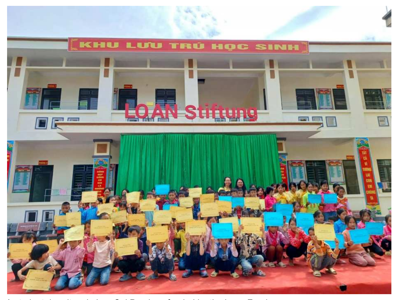
A student dormitory in Lao Cai Province funded by the Loan Fund.