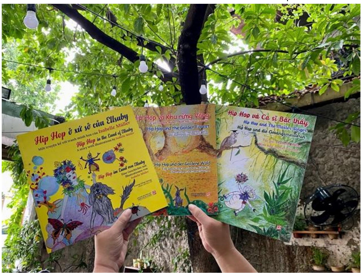
Việt Nam's booth at Frankfurter Buchmesse 2024 will feature books of various kinds.

Frankfurter Buchmesse has been organised by Frankfurter Buchmesse GmbH since 1949, when 205 German exhibitors met in the Paulskirche in Frankfurt for the first post-war book fair.