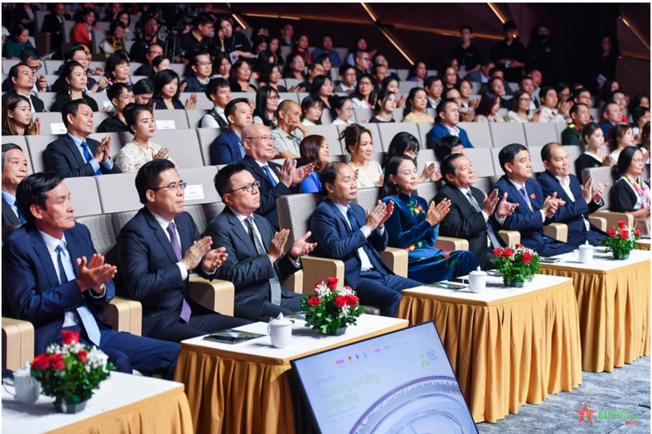
Delegates attending the Community Action Award ceremony.

The award is organized by Nhan Dan Newspaper, with the direction of the Ministry of Labor, War Invalids and Social Affairs, the Ministry of Natural Resources and Environment, the Ministry of Science and Technology, and the coordination of the Joint Stock Company. VCCorp.