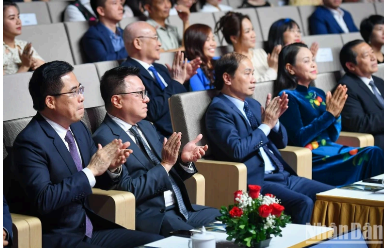
Delegates attending the Community Action Awards of Nhan Dan Newspaper.