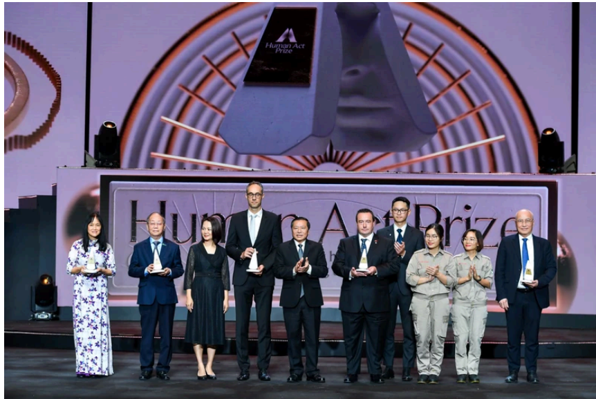
28 projects were honored at the Community Action Awards Gala.

NDO - On the evening of December 11, at Hoan Kiem Lake Theater, Hanoi, 28 excellent projects and ideas were selected by the Organizing Committee of Nhan Dan Newspaper's Community Action Awards - Human Act Prize 2023 to award prizes. .